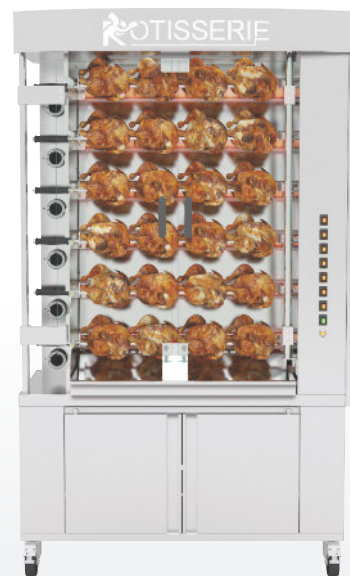
1175.6SMiG Stainless steel finish