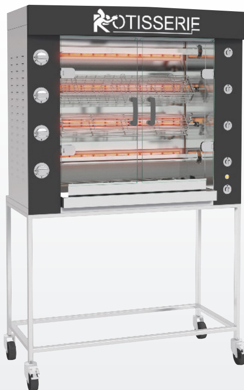
1160.4PG Black enamel