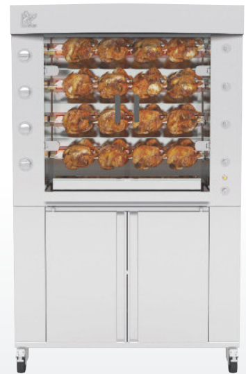
1160.4PiG Stainless steel