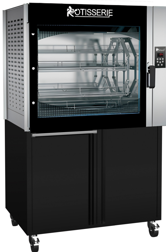
FBP8.760 + FBP8.76MSTO (optional base cabinet)

Additionally, K-GLASS minimizes heat emission in the kitchen, creating a cooler and more comfortable workspace for your team. The enhanced insulation also improves safety by preventing burns upon contact with the door surfaces, ensuring a secure cooking environment.