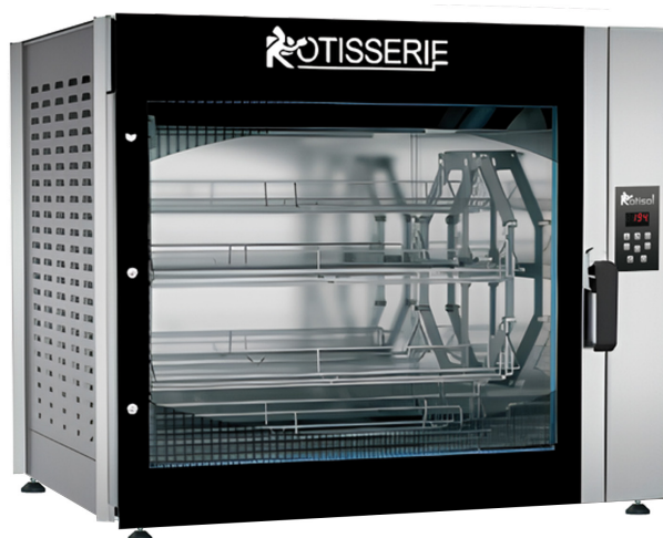
FBP8.760 + FBP.PIED