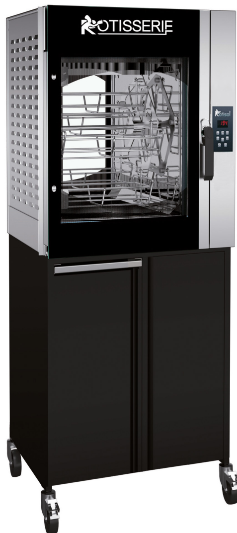
FBPT5.360 + FBP5.36MSTO (optional base cabinet)

Multiple recipes + manual control (+ can add up to 99 programs)