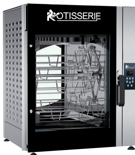
FBPT5.360 + FBP.PIED