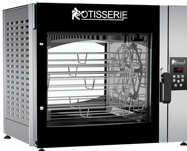
FBPT5.560 + FBP.PIED