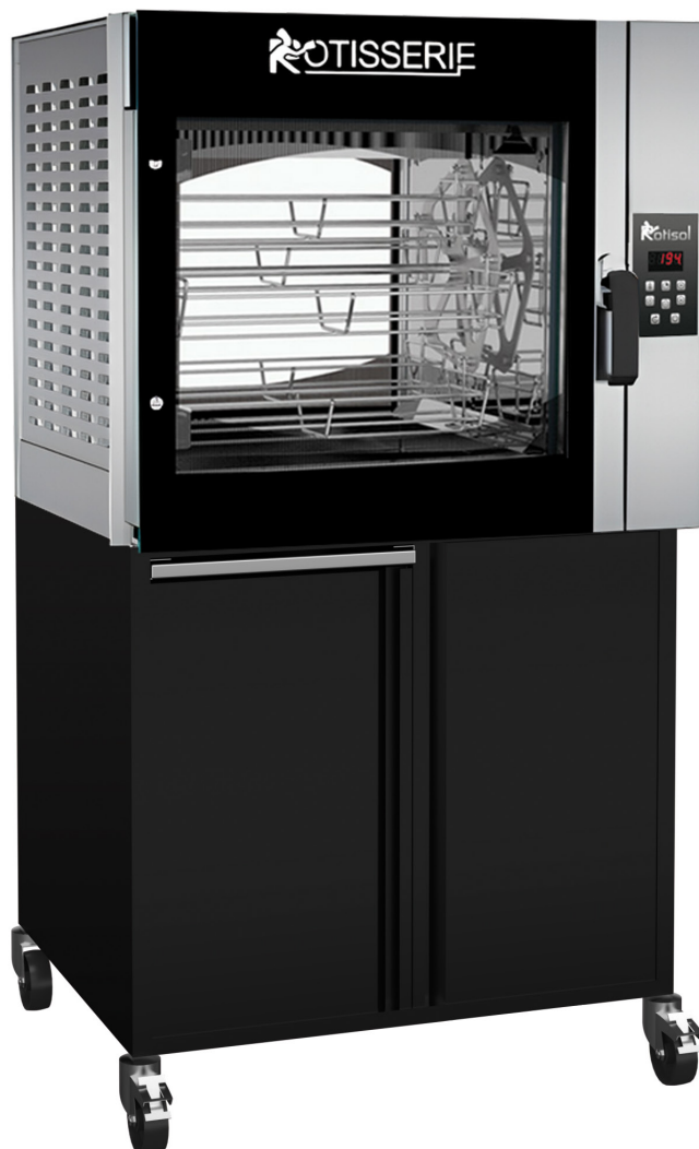
FBPT5.560 + FBP5.56MSTO (optional base cabinet)

Multiple recipes + manual control (+ can add up to 99 programs)