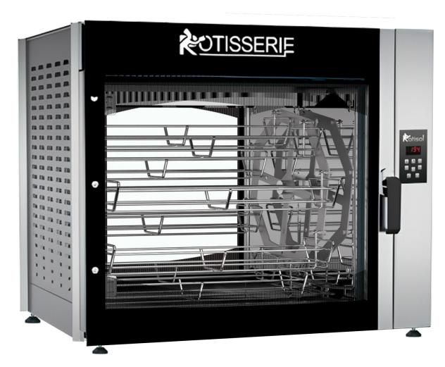
FBPT8.760 + FBP.PIED