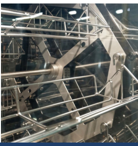
DISTRIBUTOR / AGENT