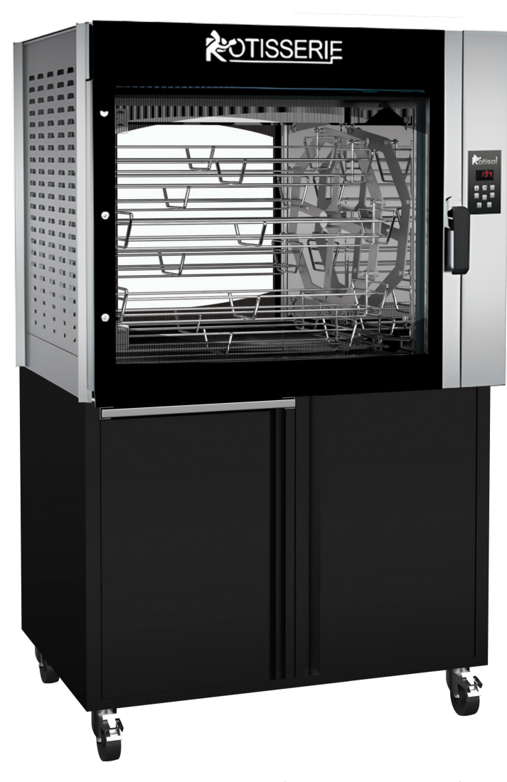
FBPT8.760 + FBP8.76MSTO (optional base cabinet)

Multiple recipes + manual control (+ can add up to 99 programs)